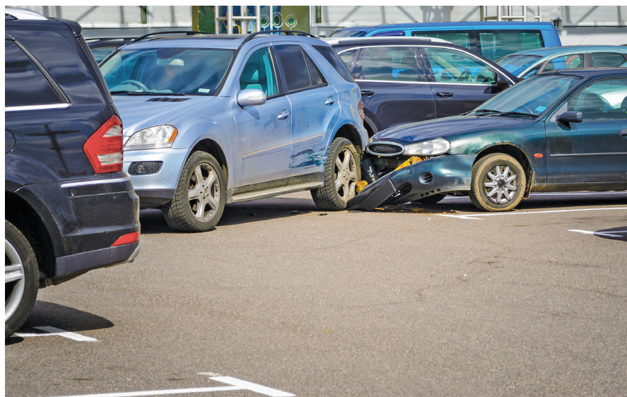
LOTS OF PROBLEMS – Drivers should use caution before pulling in or out of spaces in a parking lot.

solely on their rearview mirrors or backup camera when they’re reversing, Salamanca said, and that’s risky. In addition to using the mirror and camera, be sure to “look over your right shoulder first, through the back passenger window, because that’s the closest path of travel for another car,” he said. Then, repeat the process over your left shoulder, and finally,